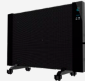
READY WARM 2000 NOW