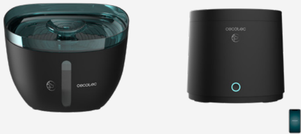
PUMBA 2200 REFRESH