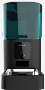
PUMBA 6000 PURRFECT MEAL SMART