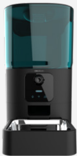
PUMBA 6000 PURRFECT MEAL SMART VISION