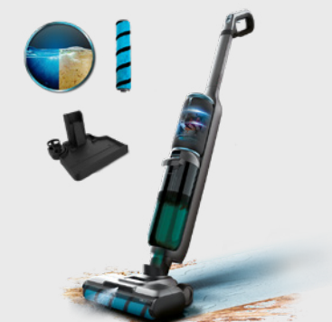
FREEGO WASH&VACUUM SPRAY