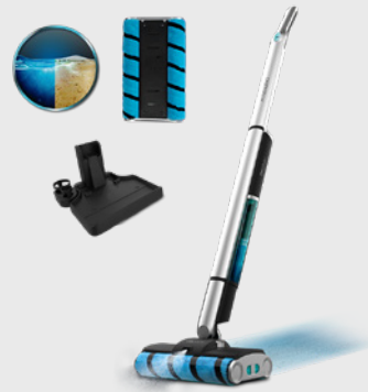
FREEGO WASH TWICE SPRAY